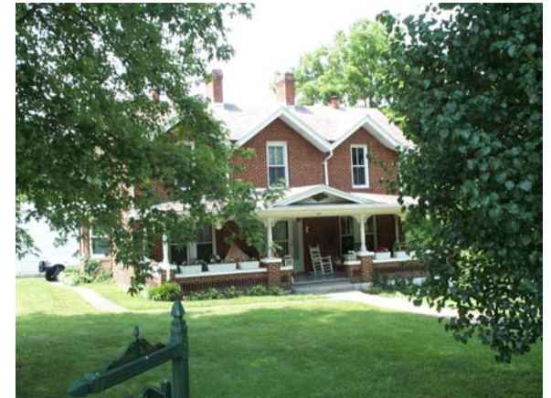
#5: Interior Filming Only. Hickam House. 110 Roane Street. Former J.S. Keebler home. Note that the exterior filming of the Hickam house was done in Petros, Tennessee.