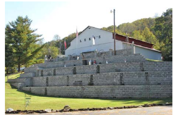
#6: Interior Filming Only. Hickam House Basement. The basement set was built in this barn behind the Parnell house at 315 West Spring Street.