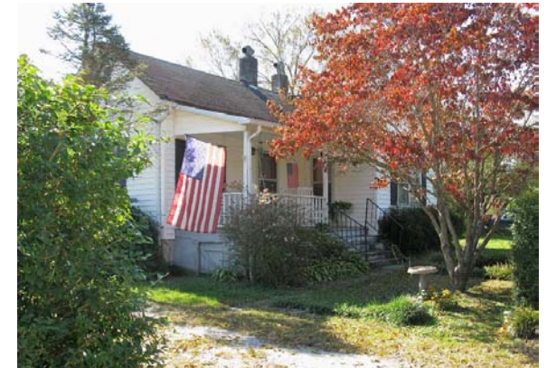
#10: Street Scenes Used in the Filming. This is the house at 307 Kingston Avenue used for the exterior filming of Ms. Riley's home. Homer is seen riding his bicycle, dropping it in the driveway, and running up the steps to visit Ms. Riley.