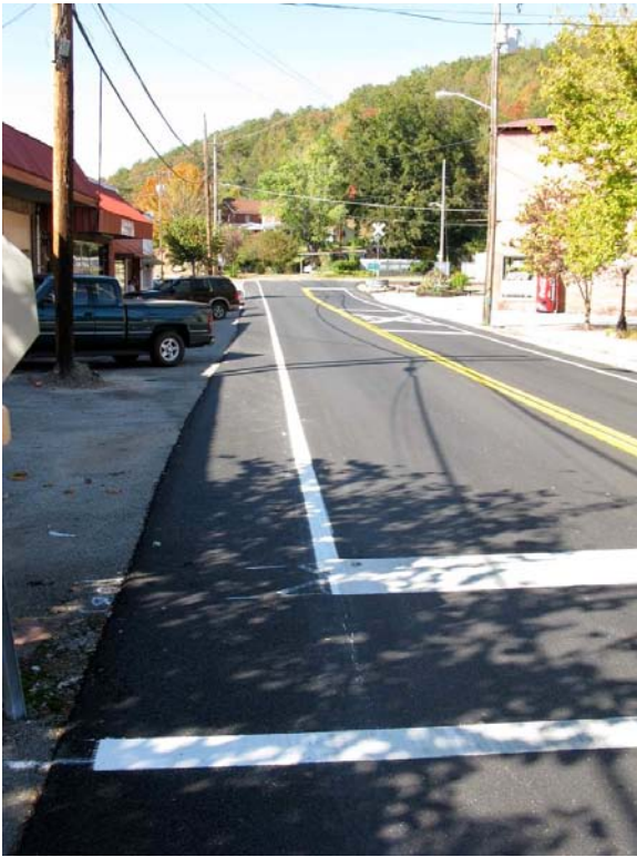
#7: (above): Street Scenes in the Filming. Main Street in Oliver Springs. Coal miners going to and from mine, general store scenes, union hall scenes, Greyhound Bus scenes.