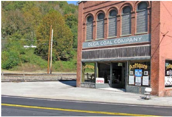
#1: Interior & Exterior Filming: Coalwood General Store. 430 Main Street. Building was originally built as the Seinknecht general store.