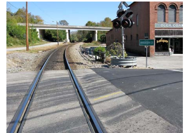
#11: Railroad with steam locomotive. The train was seen passing the Coalwood General Store near the beginning of the movie.