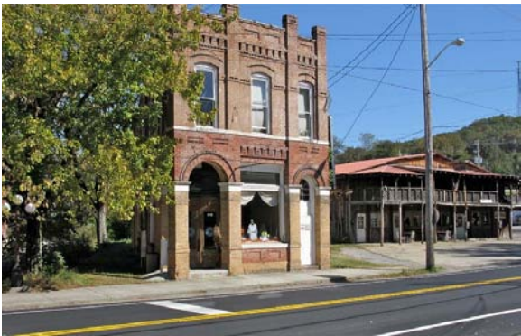
#2: Interior & Exterior Filming. Union Hall. 410 Main Street. Built in 1907 as a bank. Note the union decals from the filming that are still on the doors.