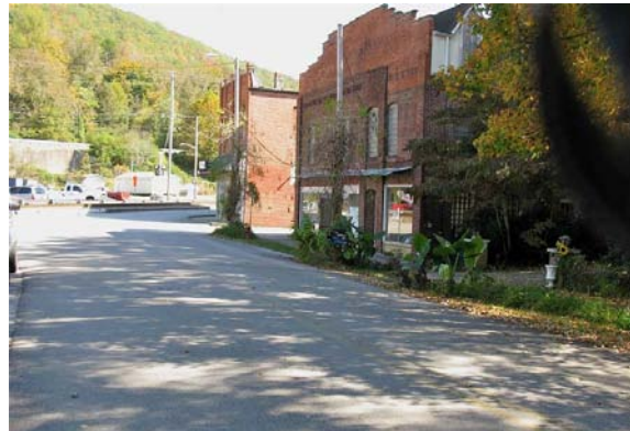
#8: Street Scenes in the Filming. Roane Street approaching the railroad track. Rocket Boys pushing their disabled car.