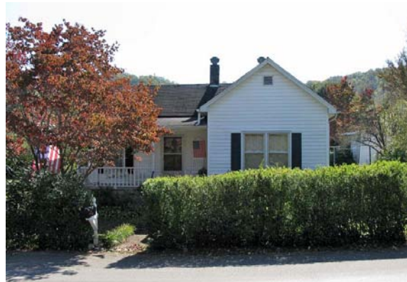
#4: Exterior Filming Only. Miss Riley's Home. 307 Kingston Avenue.